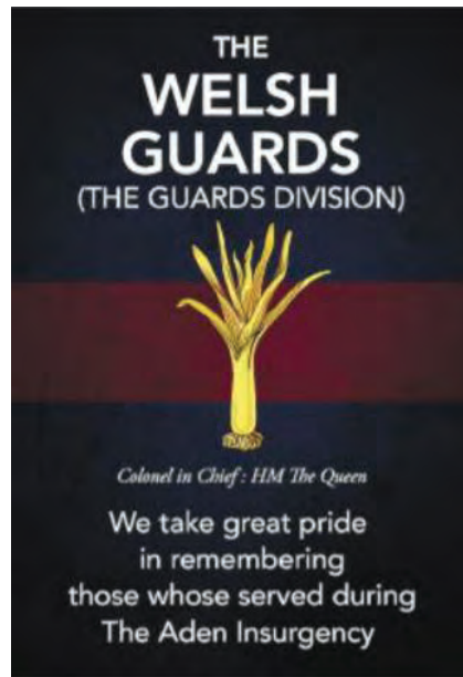
Welsh Guards full page memorial in Aden 50th year commemorative Magazine

In 2017-18 the Welsh Guards Charity spent over £113,000 looking after our Veterans and Regimental Heritage. From funding the Wrexham 35th Anniversary Falklands Reunion in June to revamping the Regiments archives for future generations, we have helped in a variety of projects and areas and will continue to do so in the future. The Welsh Guards Collection in Oswestry has received support, Battlefield Tours have been subsidized, Memorials supported, visits to the Falkland Islands subsidized for veterans (returning for the first time), funerals attended, and birthdays celebrated. Over £1,000 spent on Poppy wreaths alone to remember our forebears, £350 on a WG Memorial page in the Aden Campaign commemorative magazine and artificial leeks purchased at £1 each - just a few examples of the unseen expenditure made to fulfil an important Welsh Guards charitable objective.