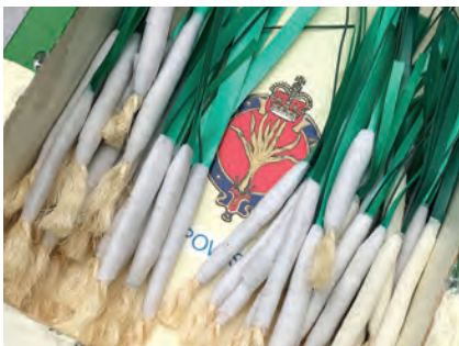
Artificial Leeks don't come cheap (£1 each) paid for by the WG Charity

Along with all other Household Division Regiments a substantial donation has been made to the Guards Chapel Organ Appeal; www.householddivision.org.uk/guards-chapel-organ-fund