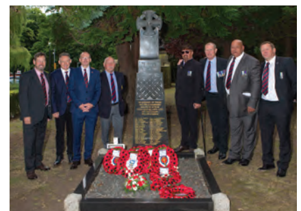
35th Anniversary Falklands Reunion Wrexham

Along with all other Household Division Regiments a substantial donation has been made to the Guards Chapel Organ Appeal; www.householddivision.org.uk/guards-chapel-organ-fund