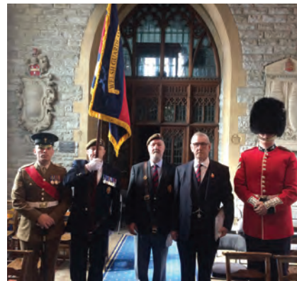
Llanelli Branch WGA Laying up of old Branch Standard supported by the Welsh Guards Charity