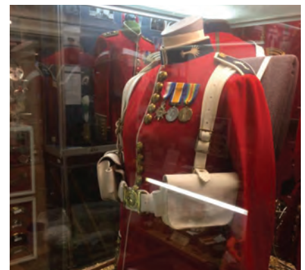
Supporting the Welsh Guards Collection